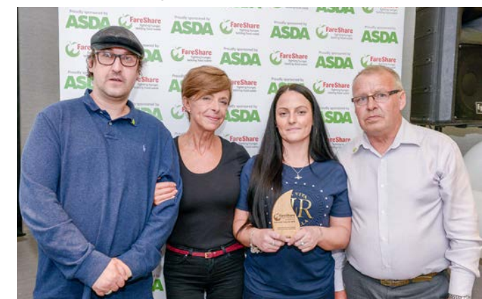
FareShare Lancashire and Cumbria Team of the Year