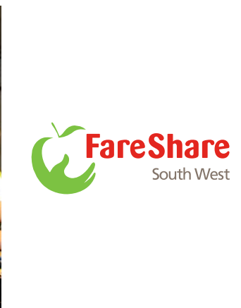
Terri Davey South West Remote Volunteer